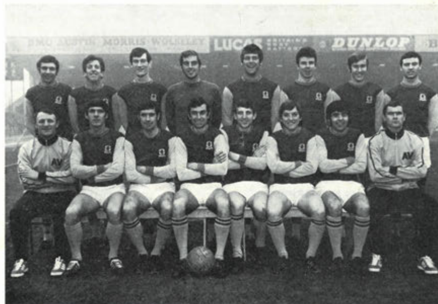
ASTON VILLA F.C. — SEASON 1968-69